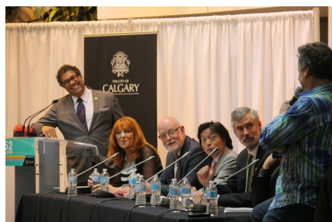
Public debate on the options drew approximately 300 people and most major media outlets.

On May 16, only 24 days after Council's motion, the public participation program was launched online and with a news conference featuring the Mayor.