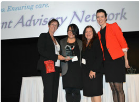
Vancouver Coastal Health Authority was named Project of the Year