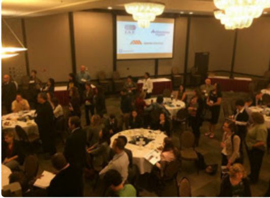
P2 practitioners and volunteers gather for the Conference

Great volunteers helped make the Conference happen, and we'd like to give a special shout-out to the Prairies Chapter, which went above and beyond in organizing the very successful Welcome Reception, recruiting the local volunteers and so much more. Thank you!